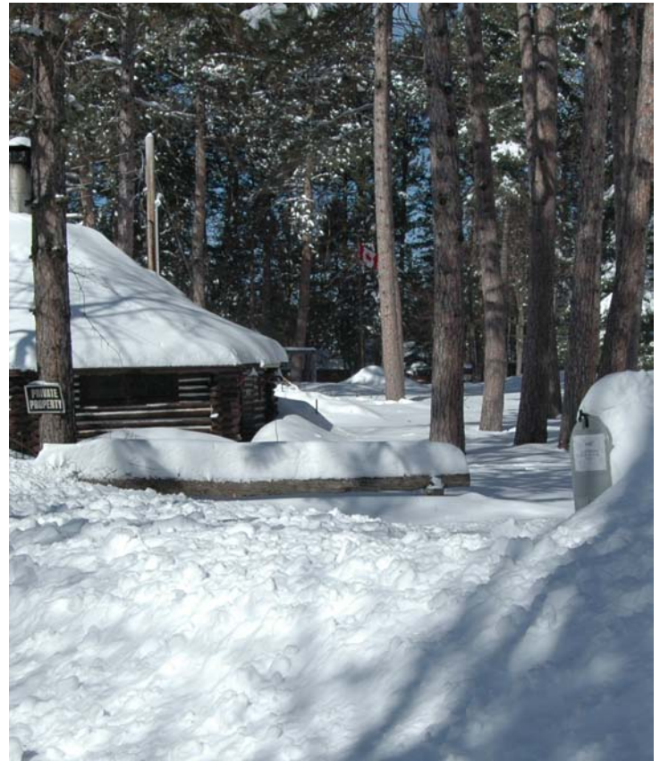
Red Pine Camp sleeps amid the majestic pines.

We do hope that you will heed the invitation of the Red Pines and find yourself within their warm embrace this coming summer.