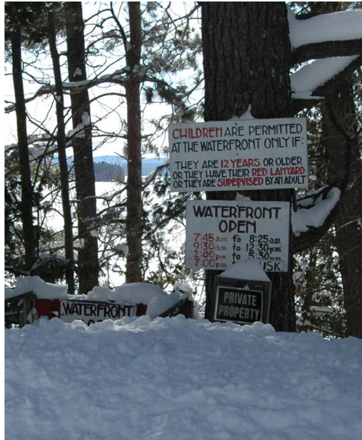
Snowed in! Red Pine is covered in a blanket of pristine white snow, awaiting the return of campers for another fun-filled summer of fellowship, fun, fresh air and shared memories.