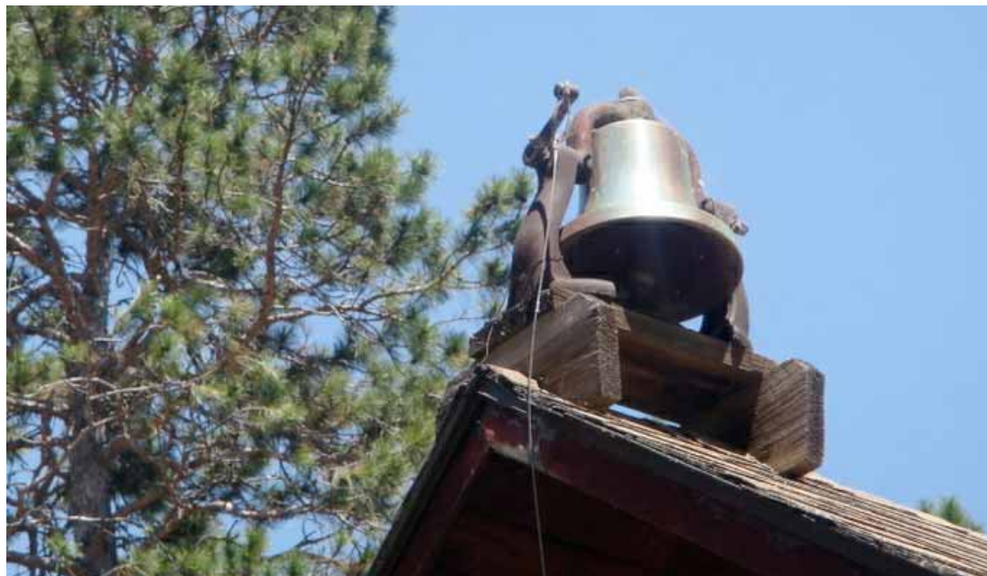
- Barry Bickerton photo

We have also added two Hobie Wave sail boats to our fleet. We know you will enjoy these easy to sail and responsive boats. Thanks